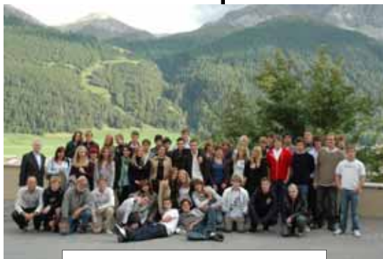
Lyceum Alpinum in Zuoz, Switzerland

"UWP saved my high school class back in the 80's; maybe they can do something for those kids here as well" said our contact in the school when contacting us to develop a program applying our Conflict and Resolution expertise to help them.