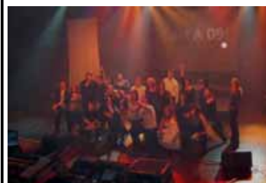
Cast A 2009 Opening Session

34 students , meaning almost 50% of the Cast were Recruited by the European team (in fact, representing the EMEA). Our Students represent 13 countries (Belgium, Netherlands, Germany, Switzerland, Sweden, Norway, Denmark, Finland, Ethiopia, Liberia and Israel). That would not be possible without the continuous support from our dedicated European Alumni. For making Cast A 2009 happen, for making UWP once more a true relevant experience for those 72 students THANK YOU!