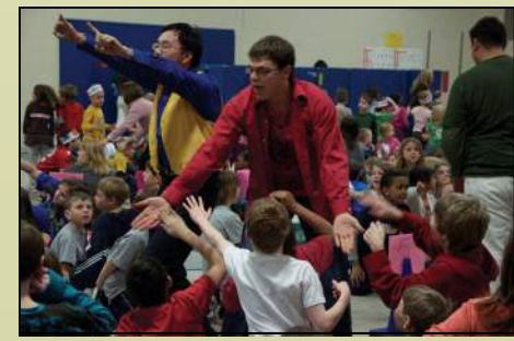
TS Performance at Gleason Lake Elementary School, Minneapolis, Minnesota