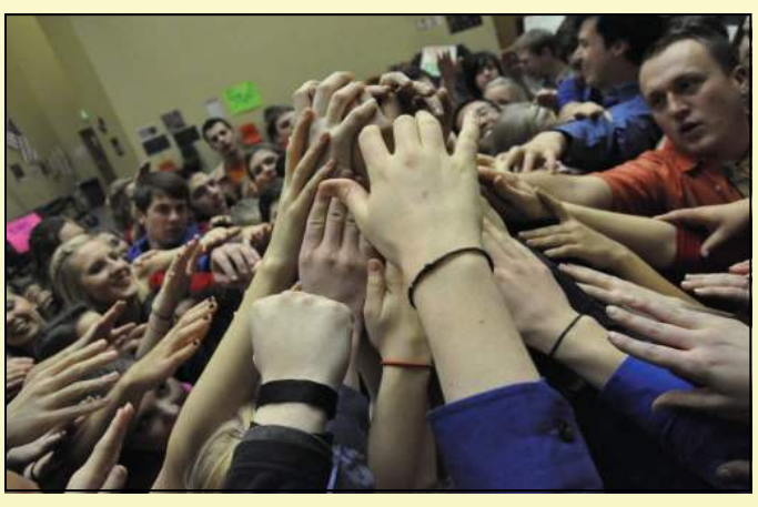
First Green Room before the Premier of Cast A 2010 UWP Show