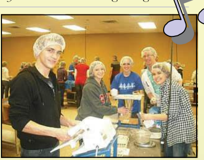
Feed My Starving Children Project in Minneapolis, Minnesota