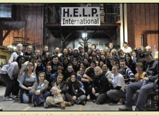
Haiti Food Project for H.E.L.P. International in Fort Collins, Colorado

the easiest way to experience and learn about their culture. By living the way they live, understanding why they do what they do, I enjoy their stories, their activities and hobbies and then sharing with them who I am.