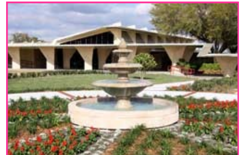
The organic design that graces the campus of Florida Southern College is the work of Frank Lloyd Wright.

For FSC, working with UWP will provide yet another way for their faculty to engage in the blending of classroom and experiential education. We will be all the better for it.