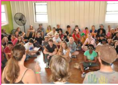
Cast A 2011 Educational Workshop

As a result of this agreement, the UWP program will be more marketable as a study abroad option, especially for university students, and will offer increased academic opportunities for gap year and international students.