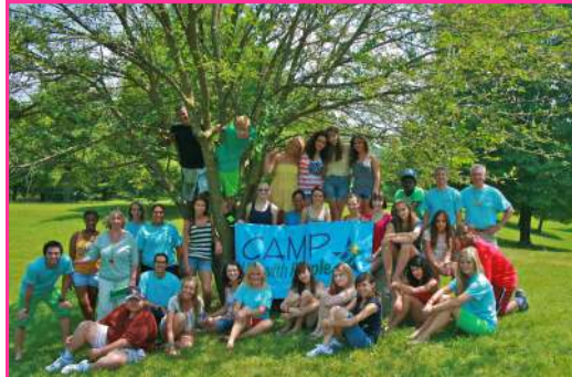
Camp UWP Cast A

WOW....where do I begin! The first summer of Camp UWP was a huge success!! Fifty-four campers from 12 countries (56% non-U.S.) and 9 U.S. states participated in this summer's two 3-week sessions...Cast A and Cast B!