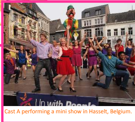
Cast A performing a mini show in Hasselt, Belgium.

We will never forget this past tour in Europe, and how it has felt to get to know the cultures we have visited. All