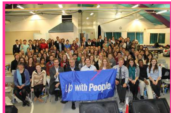
Cast A in Eskilstuna with the sponsors, beneficiary and Eskilstuna Mayor!

the wonderful people the cast has met, and the beautiful mark that we have been able to leave in each community, have been immensely more rewarding than any vacation could ever be. Although we have slept little and worked much, we are leaving Europe feeling that we have received more than we have given.