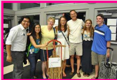
One of the most exciting parts of the first Staging and Orientation weekend is meeting one's host family for the first time.