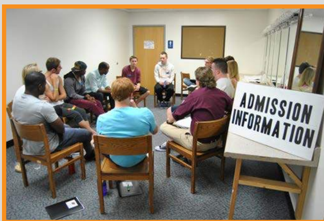
Members of Cast B 2013 meet with Up with People's Admissions team to learn about how they can promote the program to young adults while on tour.