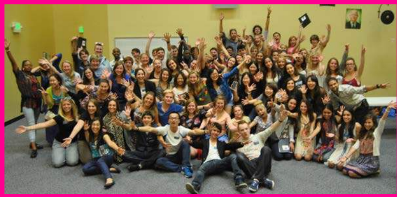
Cast B 2013 takes it's first group picture—the first of many during their six month journey together.

Up with People's Staging and Orientation has officially begun for Cast B 2013 in Denver, Colorado! New faces are being introduced, new routines are being learned, and new opportunities are being experienced. Take a look at some of the pictures collected from Cast B 2013's first week in Up with People.