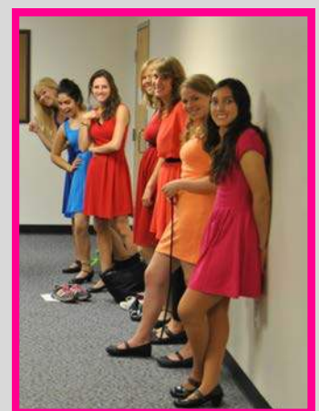
Some of the ladies of Cast B 2013 try on their show costumes.