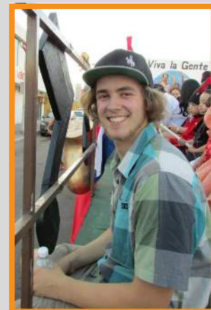
Cast B 2013 had the opportunity to ride on a float in a parade in Mexico.

I am excited to do another semester with Up with People but when I get home, I am looking forward to sharing my experiences from the cultures I have visited, especially the Native American culture.