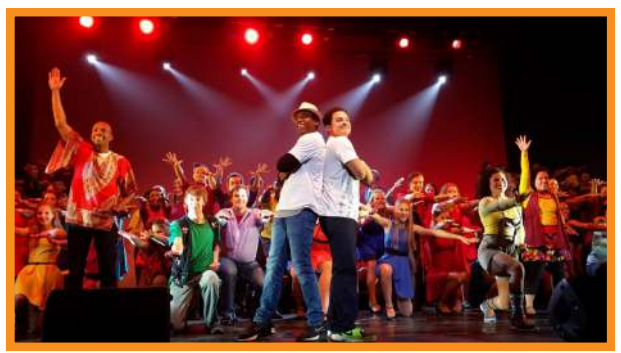
Members of Cast A 2014 perform "Party 'Round the World," a hit song in UWP's current show, Voices.

Since July 2012, audience members around the world have stomped their feet, clapped their hands, and sung along to the sounds and sights of Up with People's (UWP) latest production, Voices . UWP's current cast, Cast B 2014, hits the road in August, and will be the last cast to perform the show before it is locked in the UWP vault. Have you seen Voices ? Check out Cast B 2014's tour schedule to relive the excitement again in a tour city near you. If you have not seen Voices , here are ten reasons why you should purchase your ticket today: