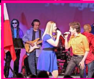
Up with People's 2014 Gala will include live entertainment and the opportunity to bid on great live and silent auction items.