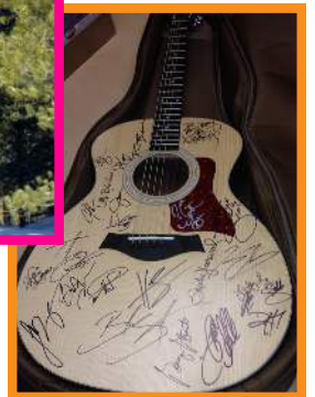
This year's gala boasts of fantastic live and silent auction items including a cabin stay in Breckenridge, Colorado; a guitar signed by over 15 major country artists including Tim McGraw, Lady Antebellum, and Garth Brooks; and a Kenyan safari. Pre-bidding will be available soon.