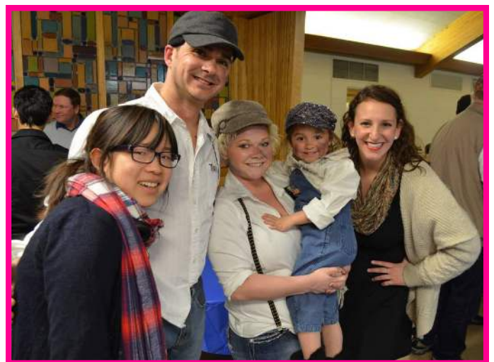
Members of UWP's road staff (top, middle) dressed in era clothing. Host families also dressed up to greet Cast A 2014 (bottom).