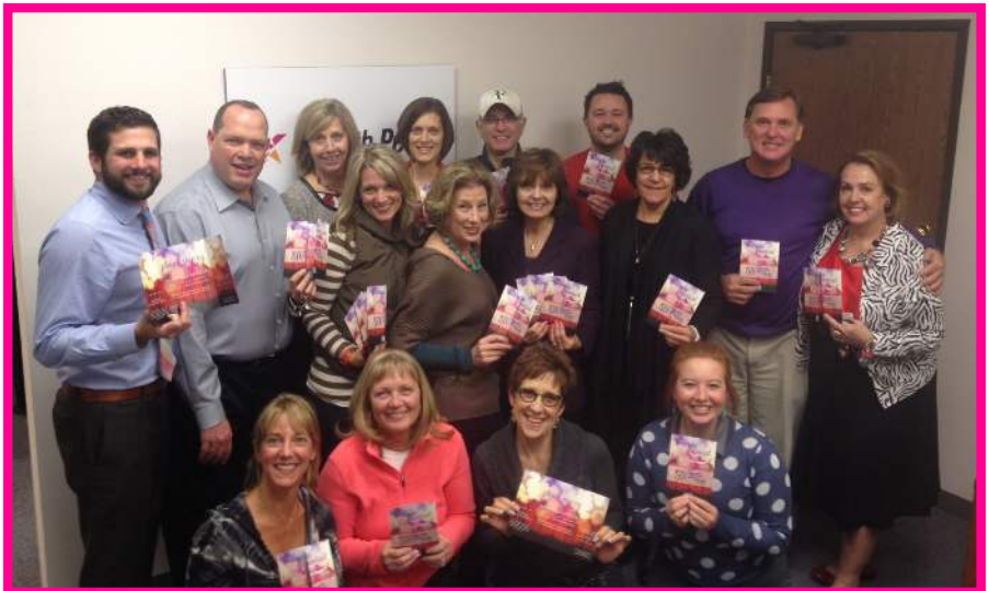
Members of the Host Committee for Up with People's 2014 Gala hold up invitations to the event. Tickets are selling fast and are available by clicking here .

Dig out your show costume and pack your suitcase! You are about to receive a backstage pass to Up with People's 2014 Gala: A Glimpse Behind the Curtain presented by Coldwell Banker Residential Brokerage on Saturday, April 26th at 6pm at the Denver Marriott City Center. While you are not likely to leave the ballroom of the hotel, a ticket will allow Up with People (UWP) alumni to travel back in time to some of the most fun months or years of their lives. If you are not an alumnus of UWP we invite you to attend and experience the sights, sounds, and impact of an organization changing lives around the world.