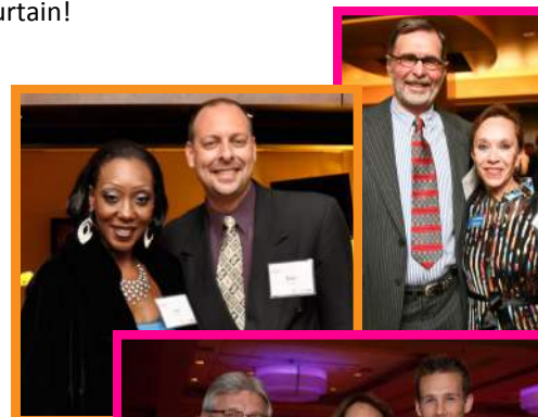
UWP alumni and friends from around the world have attended galas in the past.