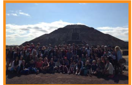
Cast A 2014 poses in front of the pyramids of Teotihuacan (top right image) and three members of UWP's staff met 'Elphaba' (second from left), a character in the official Mexico Broadway show, Wicked (bottom right image)

perform! The cast also enjoyed a guided tour of the ancient pyramids of Teotihuacan and Mexico's historic downtown. Their tour day ended with an event called “UWP Day.” Community members, families, and youth from around Mexico City were invited to learn more about our program. Several students from Mexico City were inspired to travel in a future UWP cast.